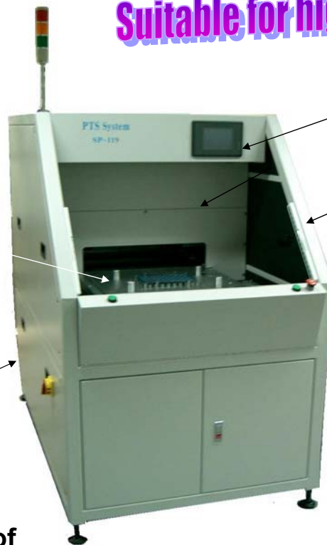
Touch screen controls