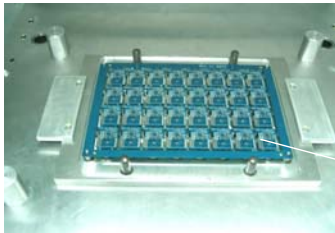
Load/unload pcb on lower die set at work area

30 tons of hydraulic power takes on all types of boards!